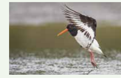
All images copyright 2017 David Williams Design and layout by www.calicoimages.co.uk